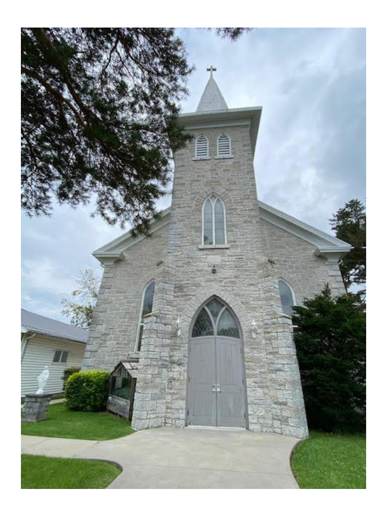
St. Patrick's Church 3977 Sydenham Rd, Sydenham, ON K0H 2W0