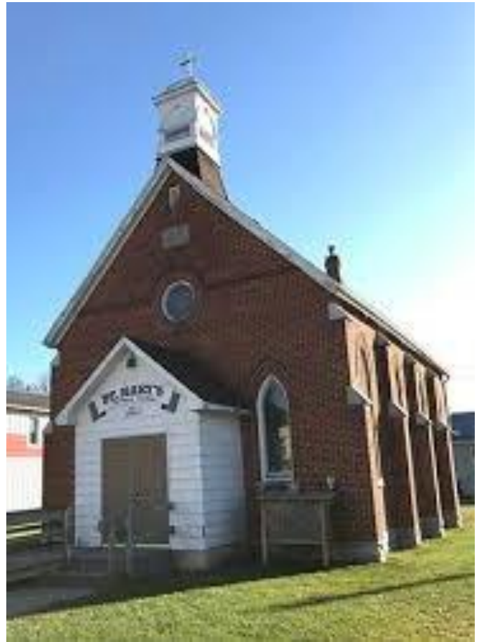
St. Mary's Church – Mission 131 Main Street Odessa, ON K0H 2H0